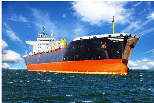
Supplies for Vessels or Aircraft