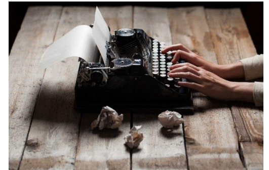
Common Use – Loans to Writers

Instruction 8: “You must pay the tax on your business use of taxable articles that you manufactured or imported. If you regularly sell the articles, you must compute the tax based on the lowest established wholesale price.”