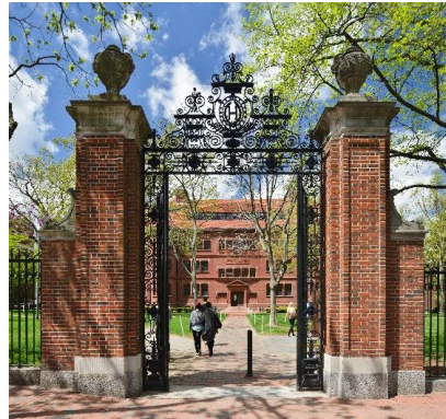
Nonprofit Educational Institution